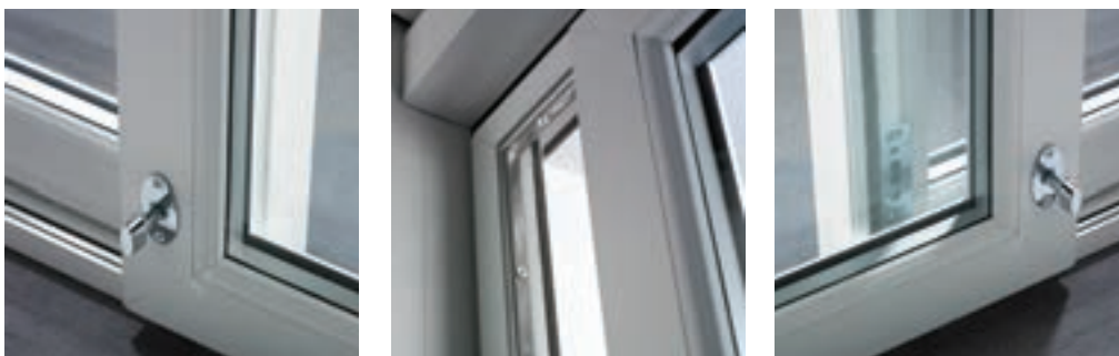
PatioMaster Secure is an optional extra to the standard range.